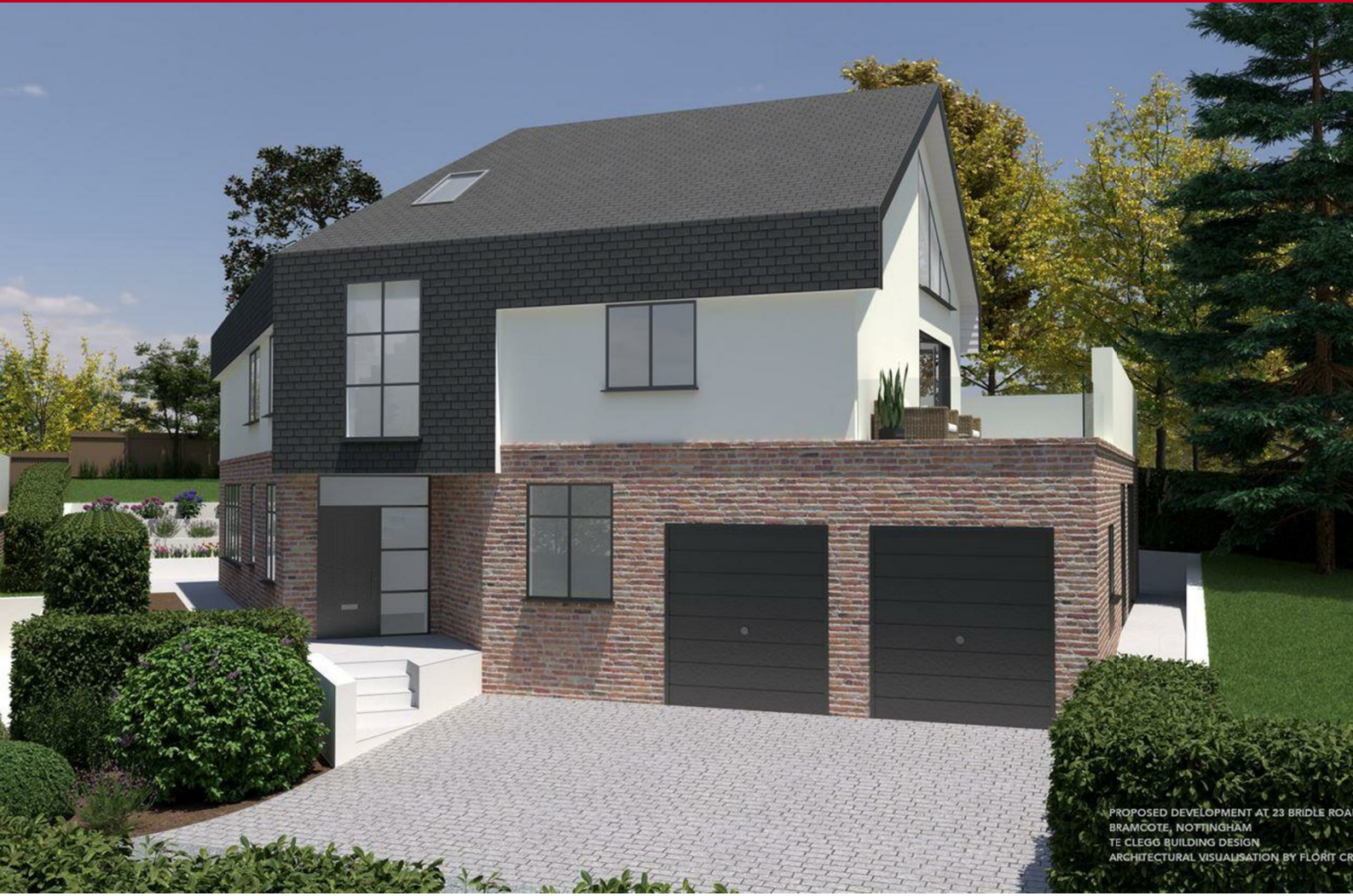
PROPOSED DEVELOPMENT AT 23 BRIDLE ROAD BRAMCOTE, NOTTINGHAM BY THE CLEGG BUILDING DESIGN ARCHITECTURAL VISUALISATION BY FLORIT CR